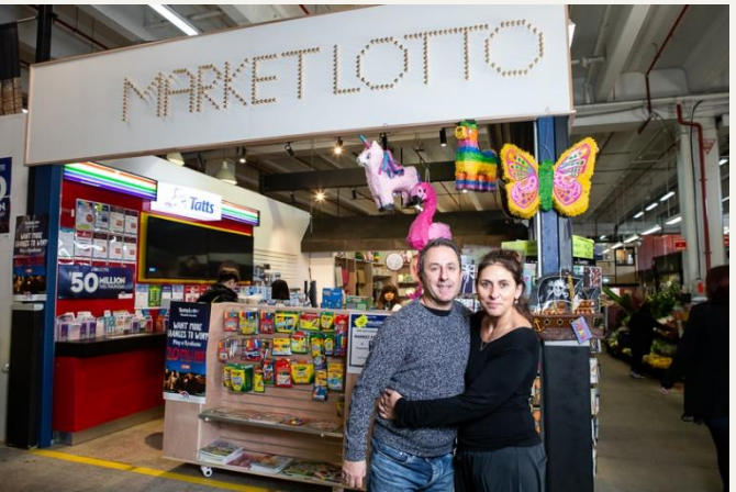
South Melbourne Market Stall Prospectus